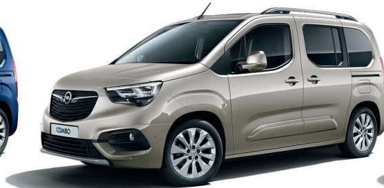
Cool Grey Two coat metallic*