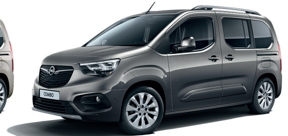
Moonstone Grey Two coat metallic*

E&OE November 2022. Images shown for illustration purposes only. Please discuss colours available with your local Opel Dealer. *Optional at extra cost. Standard paint at no optional extra cost. Due to the limitations of the printing process, the colours reproduced may vary slightly from the actual paint colour and trim material. As a result, they should be used as a guide only. Your Opel dealer has a comprehensive display of paint finishes.