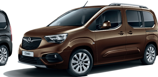
Copper Metallic Two coat metallic*