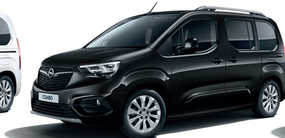
Black Two coat metallic*