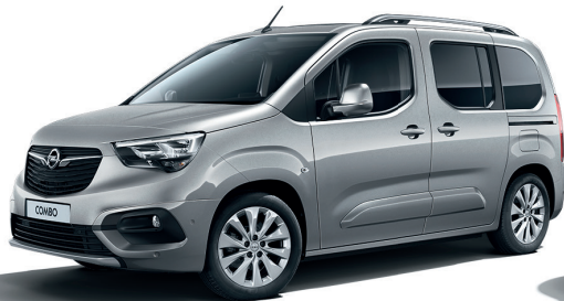
Quartz Grey Two coat metallic*