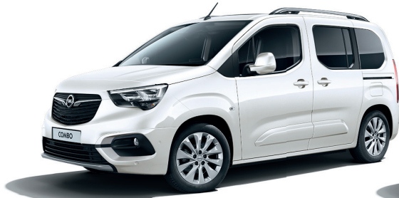
White Jade Solid