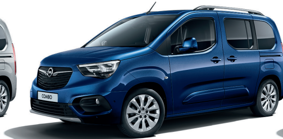
Night Blue Two coat metallic*